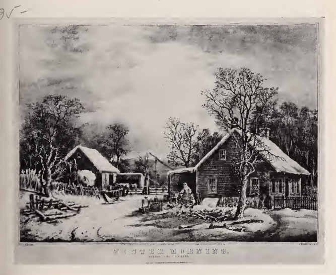
ONE OF THE RAREST CURRIER & IVES PRINTS [NUMBER 231]

Litho. Currier & Ives, after F. F. Palmer. Not dated. Large folio.